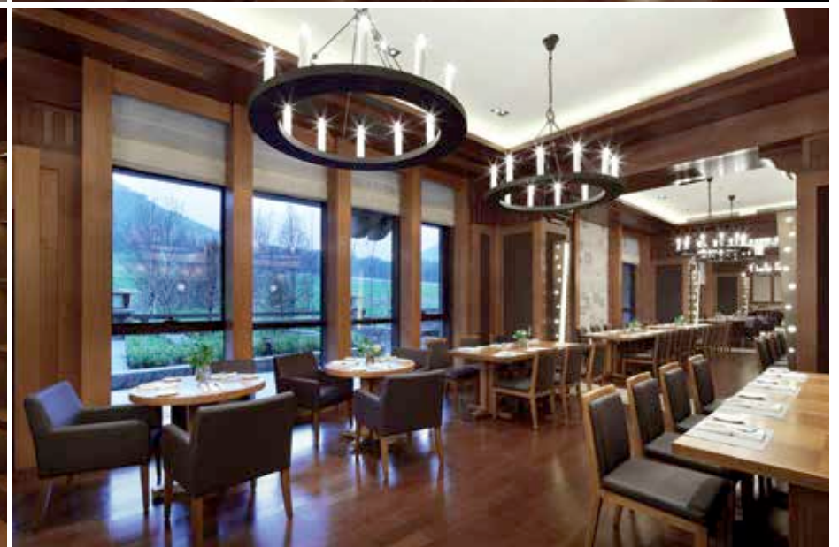
Holiday Inn Changbai Shan

different fields of specialisation and we support each other. Seldom do we have conflicts. After being partners for a dozen years, we have formed a mutual understanding towards our work as well as solutions to resolve our conflicts. (Chuckles) Although we have different viewpoints sometimes, we try to be reasonable, exchange ideas and broaden our thinking. The key is thinking as business partners. Meanwhile, it's important to put myself in his shoes. Through many discussions between us and our management team, we eventually arrive at a solution that balances our different viewpoints.