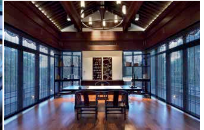
Winter Palace Restaurant