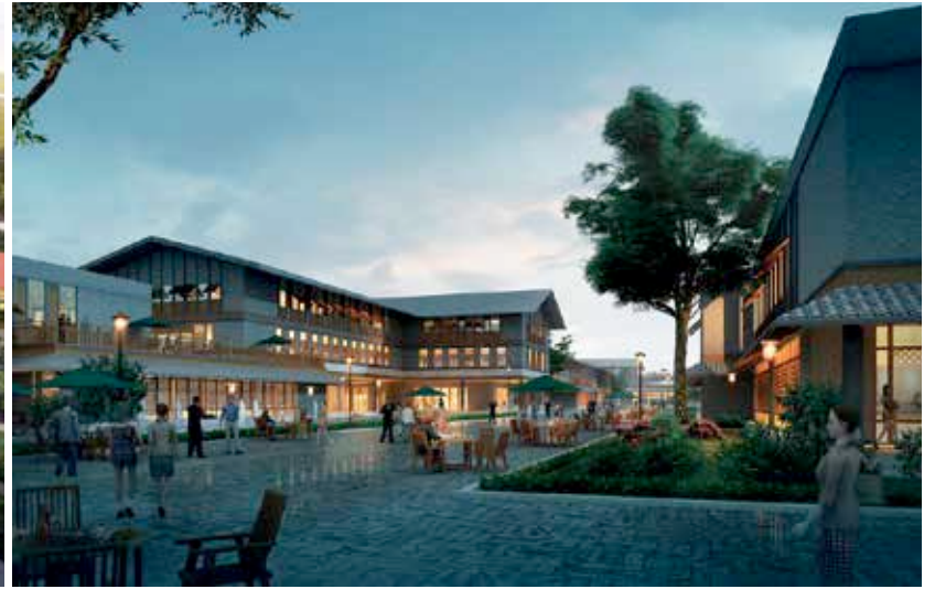
Hanzhong Great Han Culture Park