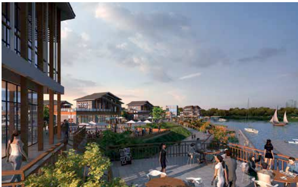
Jintang Dock Theme Park