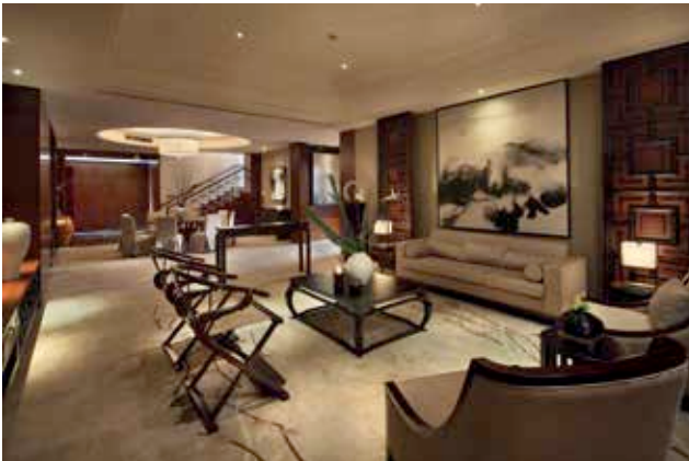
Eadry Royal Garden Hotel Haikou

with literature, designers should be actively sensitive towards anything that is beautiful in this world. Designers can draw excitement, inspiration and passion from the wide variety of beautiful things the world has to offer.